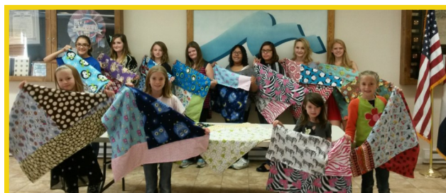
2015 4-H sewing workshop.