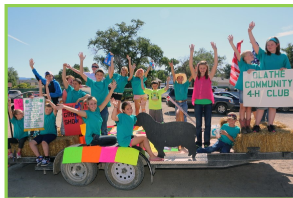
Parade float during Montrose County Fair and Rodeo