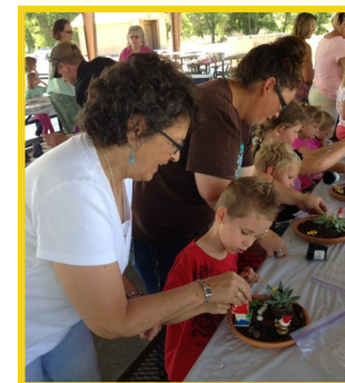
2015 Cloverbud Camp