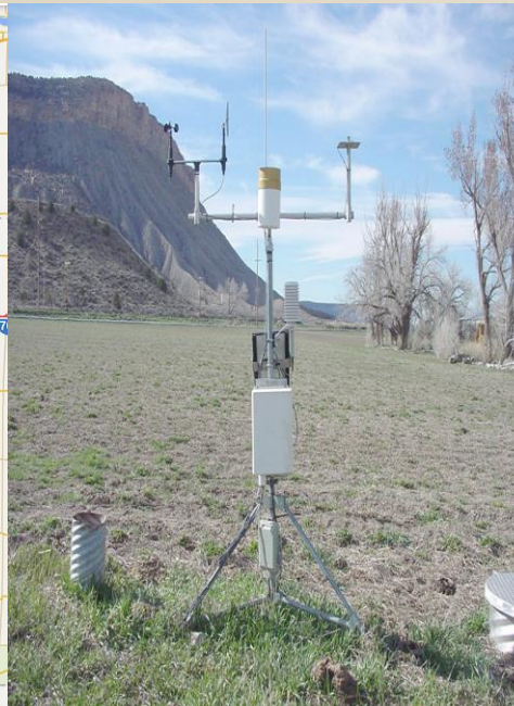
Crop Evapotranspiration in Inches